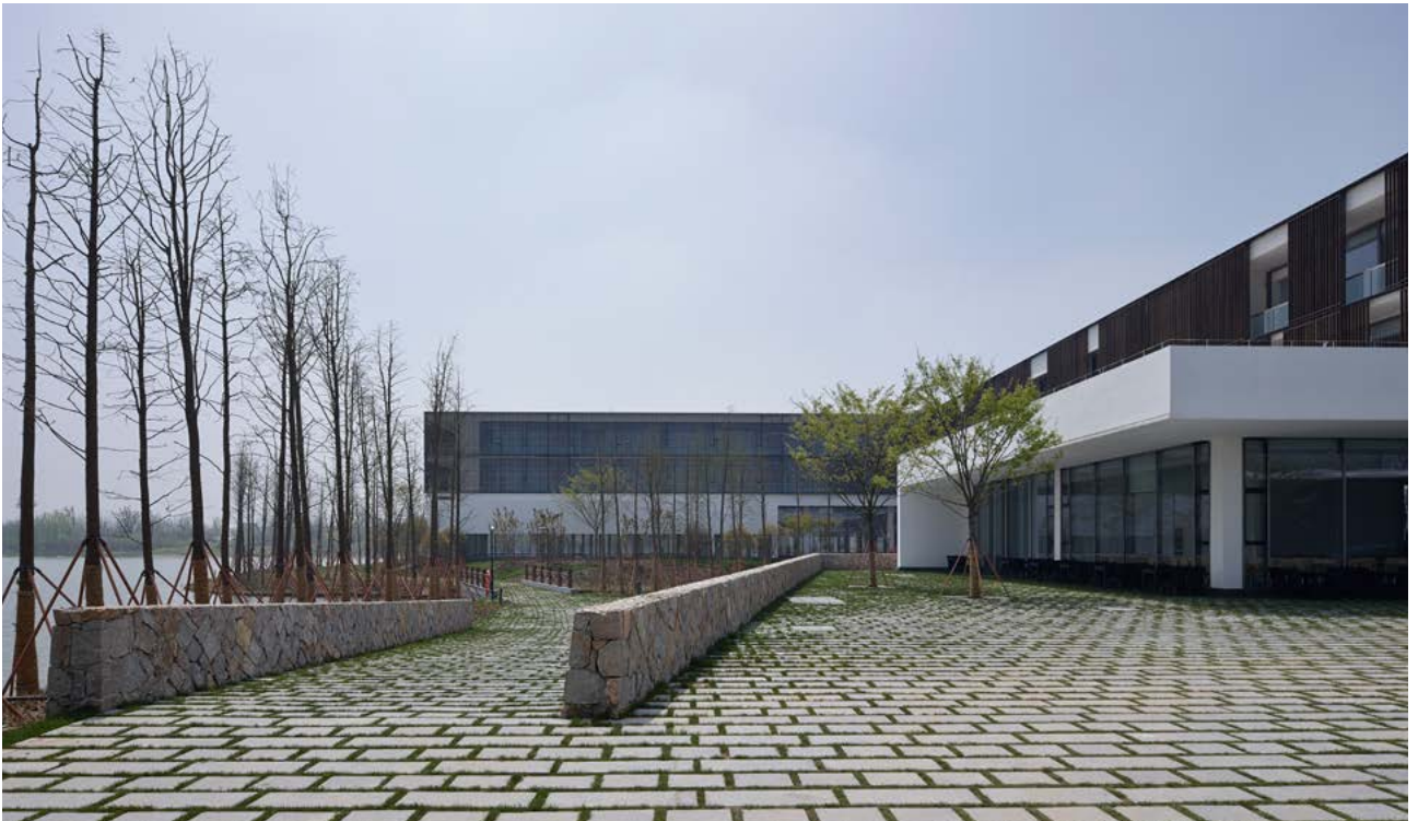
江苏省园博会综合服务中心和酒店 Service Center and hotel for Jiangsu Horticultural Expo